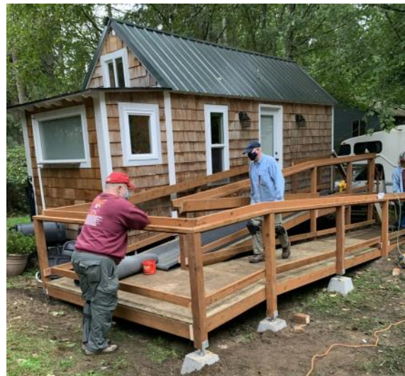
Testing the railing...