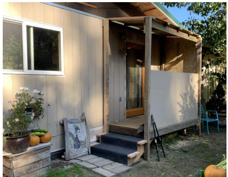
Project complete. A nice little sheltered porch with solid, non-slip stairs.