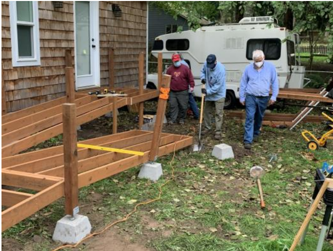
Setting the posts.