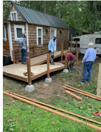
Installing the deck.