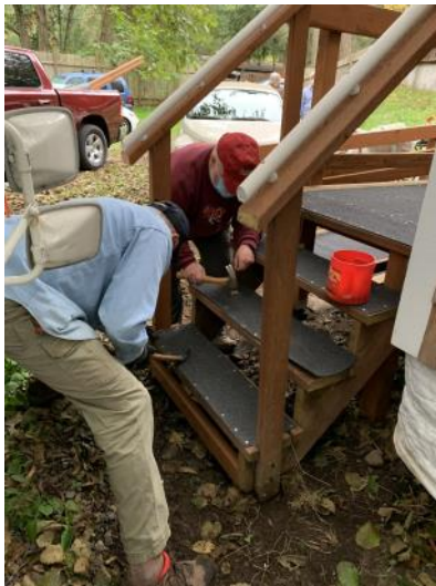
Finishing the steps.