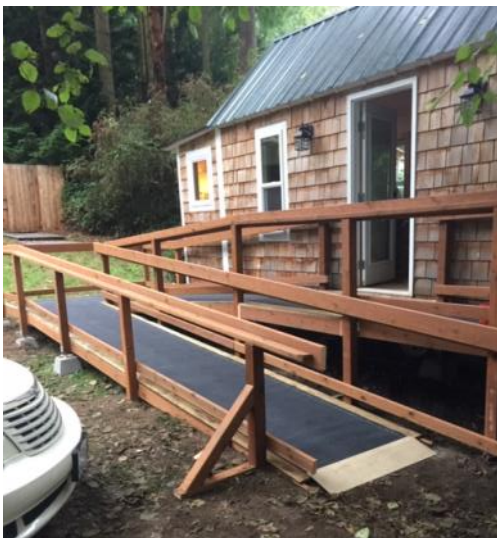
50 manhours later and it's complete!