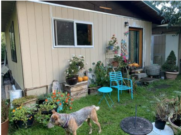
Before the project, note cinderblock stairs.