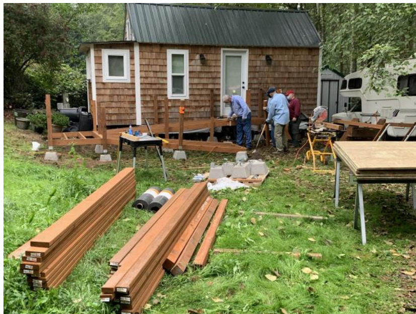
Framing is underway.