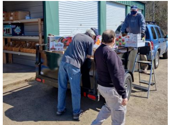
Bluebills unloading goods in preparation for local distribution.

To be part of this program, a member agency must pay $300 per year or have this fee donated by local organizations or community members.