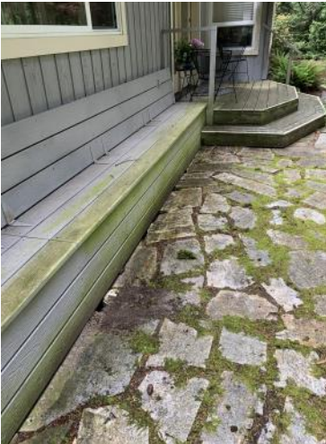
Bench to be removed to make room for the new ramp.