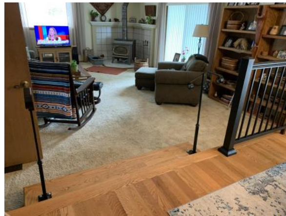
Step railings (these are also installable on concrete steps).