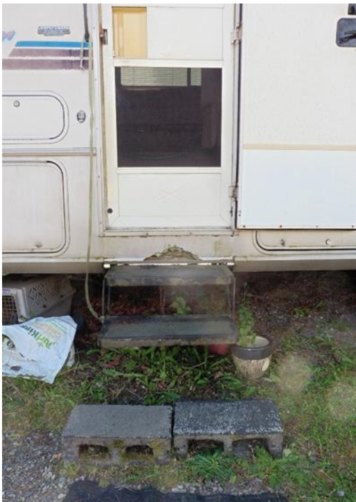
Dangerous stair steps at the Bremerton site