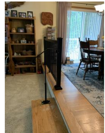
Side railing installed.