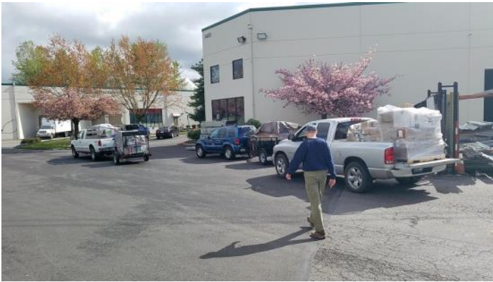
Bluebill volunteers finish loading up trucks and trailers at the Fife World Vision warehouse.

The Bluebills Essential Supply Distribution Program is done in conjunction with World Vision. PSO Bluebills represent non-profit agencies, schools and churches in Jefferson County who are members of the World Vision Program. Each month Bluebill members drive to Fife, Washington and receive 3-4 pickup truck loads of goods. These items are brought back to our warehouse, sorted, and inventoried. A list of items is then sent to each non-profit agency to select what they need for their clients.