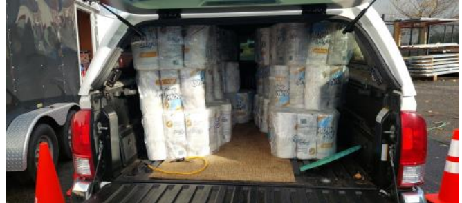
A pallet full of paper towels makes a full load for Jim Mueller's little truck.