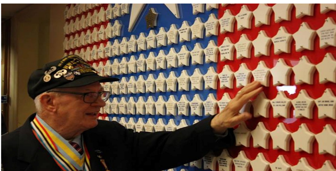
PICTURE OF THE WALL OF STARS

When it is ready to be affixed, the time can be set for all who want to attend the ‘star party’ at the USO.